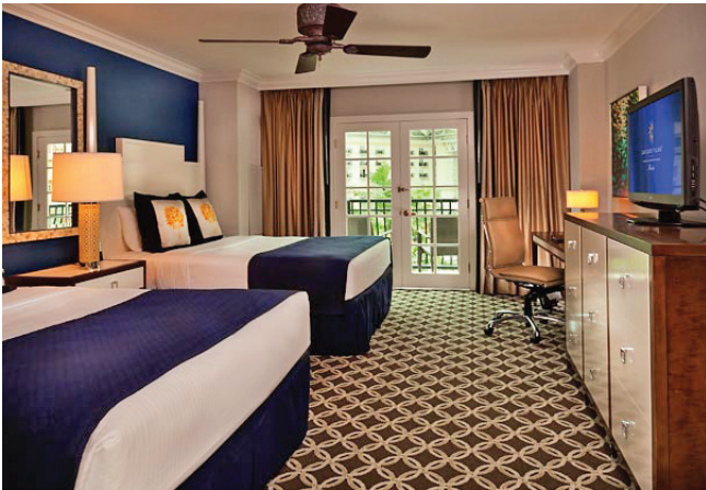
IMAGE GALLERY ~ THE WATERFRONT COLLECTION OF BICYCLE STREET INN & SUITES

7416 Main Street PO Box 1420 Mackinac Island, MI 49757 (906) 847-8005 (866) 752-0136 Fax www.bicyclestreetinn.com melanie@bicyclestreetinn.com